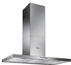
Hood KS 240_ 002