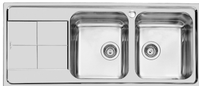
Sink KS 2112 06x